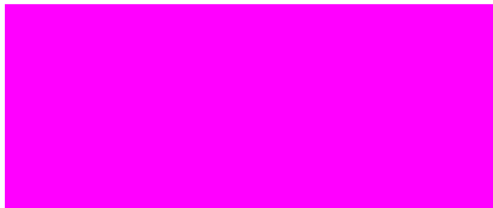
NOVAFLUO • PINK